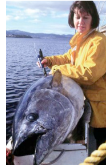
Tagging a Southern Bluefin Tuna

Since May 2005 the University of Colorado's CCAR group has been supporting a Bluefin Tuna tagging program run by the New Zealand Government's Ministry of Fisheries by providing a custom, high resolution subset of the CCAR mesoscale SSH data product. The near real-time altimeter data aids the shipboard tag and release program in locating Bluefin Tuna habitats. This program is part of New Zealand's international obligation as a member nation of the Convention for the Conservation of Southern Bluefin Tuna (CCSBT). The "archival" tags are placed inside the belly of the captured fish through a small incision. While active, the computer chip records the fish's global movement, water temperature range, depth of water traveled in and, when recaptured, its growth rate. The tags are satellite monitored and will help to provide a much better picture of the behavior and migration patterns of these fish. As the tagging program moves to new areas CCAR will update the regional data subset. Altimeter data will also be used throughout the study to better understand the relationship between sea surface height and the distribution and migration of the Bluefin Tuna. For more information see; http://www.ccsbt.org/docs/research.html , http://www.tunaresearch.org/tagagiant/technology.html , http://www.marine.csiro.au/LeafletsFolder/31sbt/31sbt.html